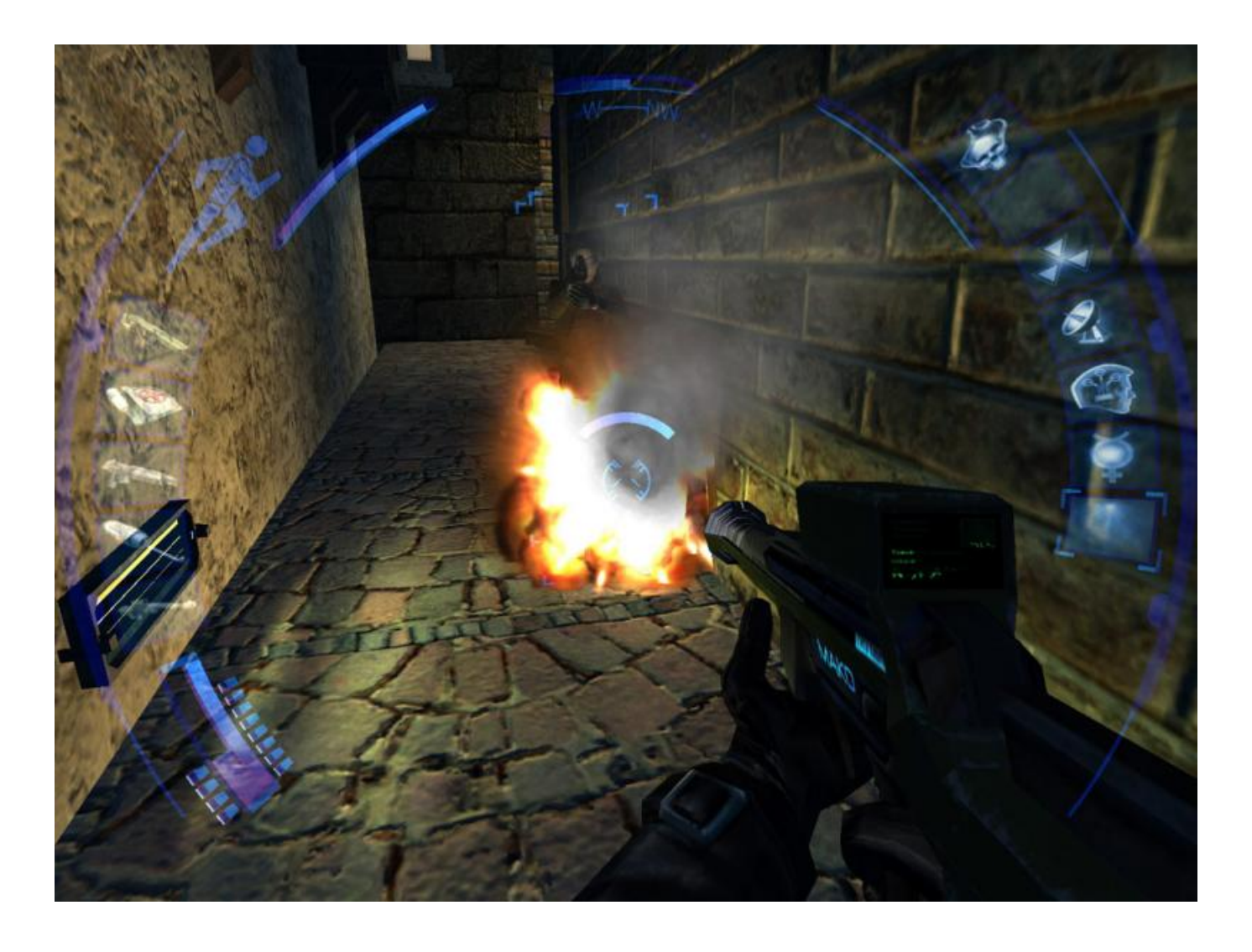
Fallout 4 - Automatron Torrent Download [Keygen]

Download ->>> <a href="http://bit.ly/2Jjwhjr">http://bit.ly/2Jjwhjr</a>